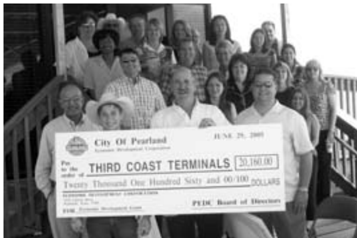
Third Coast Terminals received assistance from the PEDC for the installation of a concrete street along the company's new 6-acre development property.

"True assistance is keeping a business working and viable by allowing that business to keep