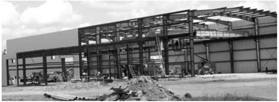
ShawCor Pipe Protection – new building expansion.

The establishment and execution of the BRE program has not only been a journey of challenges, but it has been a fulfilling journey as well. The BRE team genuinely enjoys helping our businesses; it is always a pleasure seeing business owners fulfill their business goals and dreams.