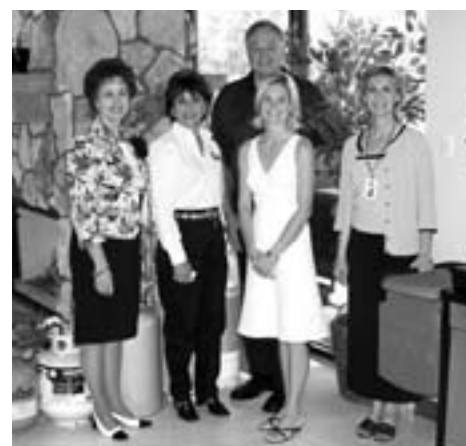
BRE Team visits local company – Specialty Gas Company.

The next day, after the conversation with the business owner, we went out and made business calls — unannounced and without appointments. We would arrive at a business and someone (usually the business owner) would eventually take time to talk to us and tell us about the business, often times giving us a tour of the facility. We may have had to wait 10, 20 or 30 minutes before we could be seen, but our persistence and patience usually paid off. At that time, we would educate the individual about the programs that are available to businesses and how the PEDC could help him or her in accessing