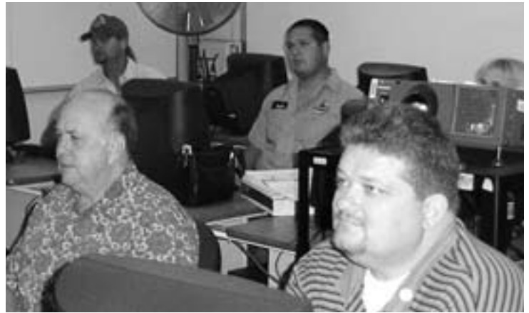
Computer Training at Alvin Community College – Pearland Campus for local businesses.

With the coordinated efforts of the city, ShawCor received its Certificate of Occupancy from the city