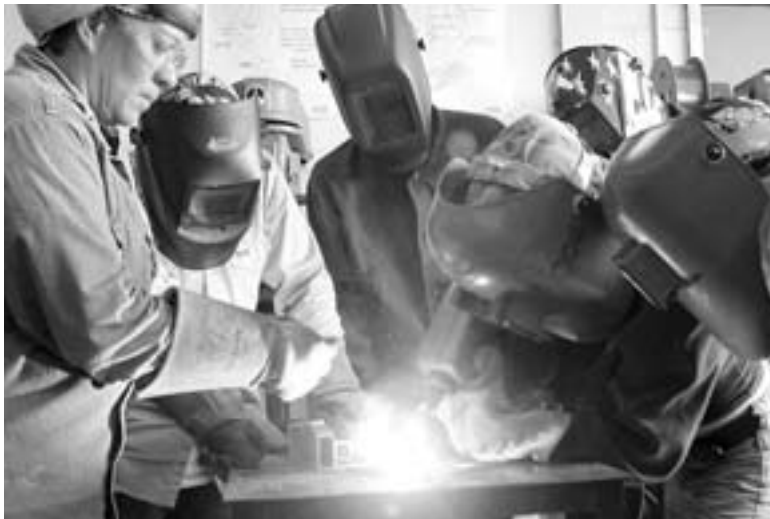
Onsite training for welders at Dynamic Lighting.

Every economic developer knows how important it is to have some sort of business retention or outreach program to the local businesses in one's community.